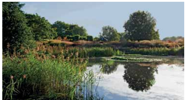
Left: Winterton Lighthouse Top: Hoveton Hall Garden Left: The gardens at Raveningham Hall, near Loddon Below: Pensthorpe Natural Park